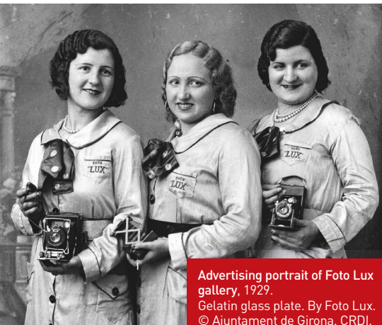
Advertising portrait of Foto Lux gallery, 1929. Gelatin glass plate. By Foto Lux. © Ajuntament de Girona. CRDI.

All photographic processes that forever changed our understanding of time will be documented: from daguerreotype to collodion process to albumen and gelatin silver prints.