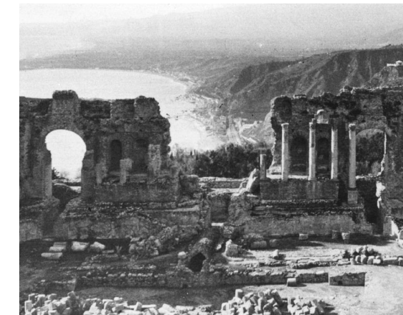
The Roman theatre at Taormina, Italy. 1890-1920.

This unique public-private partnership will demonstrate how both sectors can benefit from their participation in Europeana: private agencies can increase their business while photo archives and museums can market their collections to an even wider public.