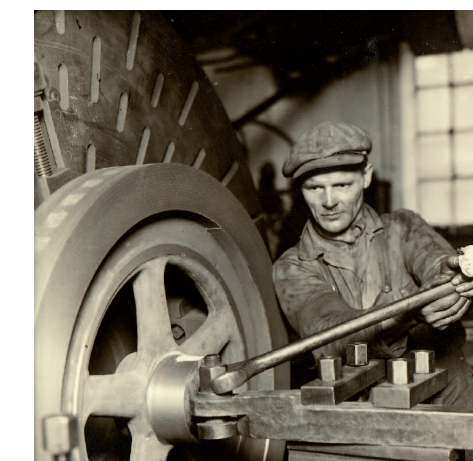
Fitter at the face lathe, Sabroe Machine Works, Århus, Denmark, 1934

Focus on places, people, events and trends that built modern Europe