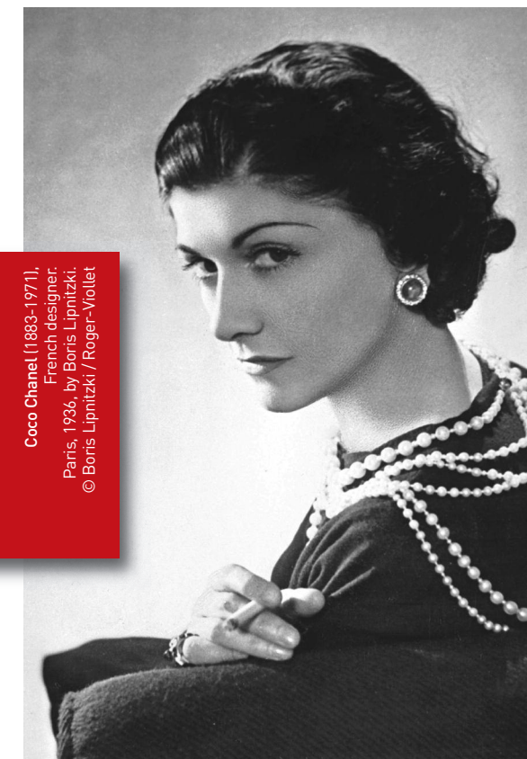
Coco Chanel (1883-1971), French designer. Paris, 1936

Over 430,000 photographs under digitization for Europeana