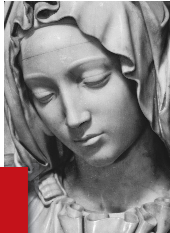
The Pietà, marble, Michelangelo Buonarroti, St. Peter's Basilica, Vatican City. 1920-1930 ca

Multilingual functionalities for better search and retrieval in Europeana