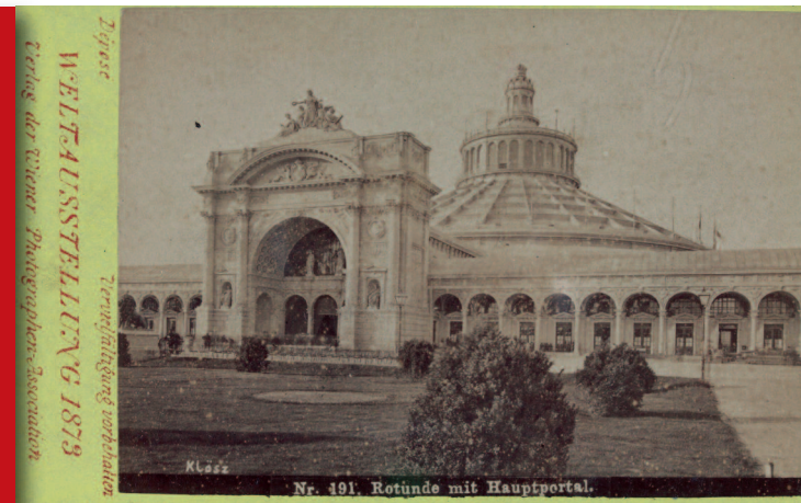
Vienna World Exhibition 1873. Rotunda with main entrance. 1873, by György Klösz. © IMAGNO/Austrian Archives

Architectural images, landscapes, cityscapes, paintings, sculptures, archaeological sites to illustrate history, art history and archaeology across Europe.